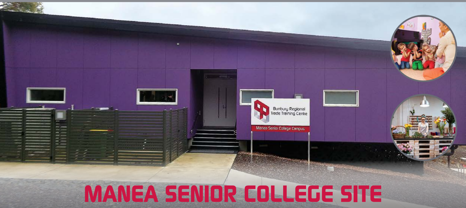
MANEA SENIOR COLLEGE SITE