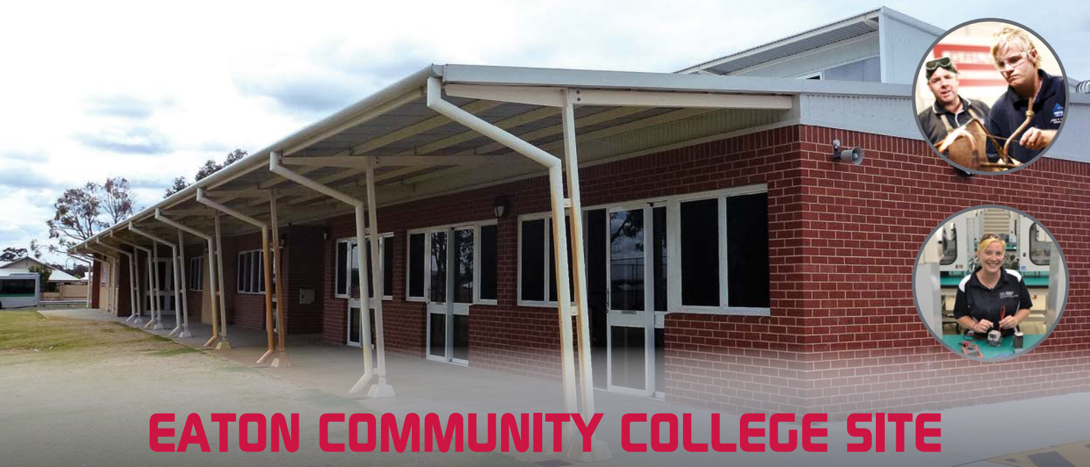
EATON COMMUNITY COLLEGE SITE